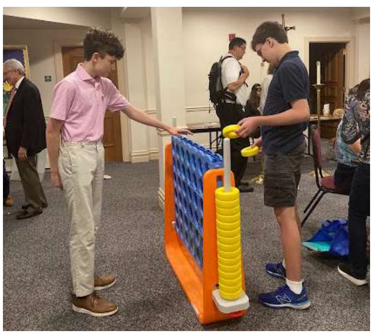
Enjoying one of the many games at the Rally Day Carnival.