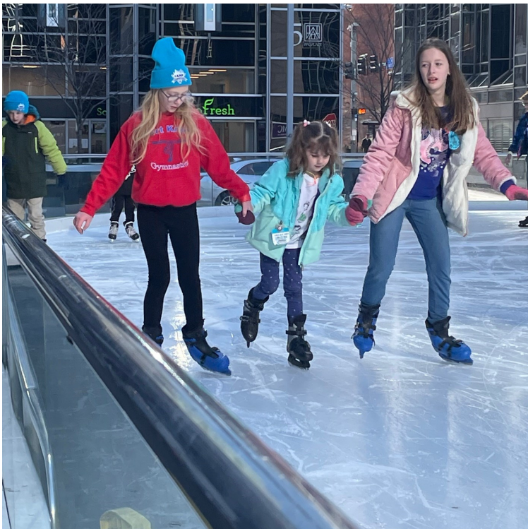
Ice skating at PPG Place concludes Icefest: Hands of the Potter.