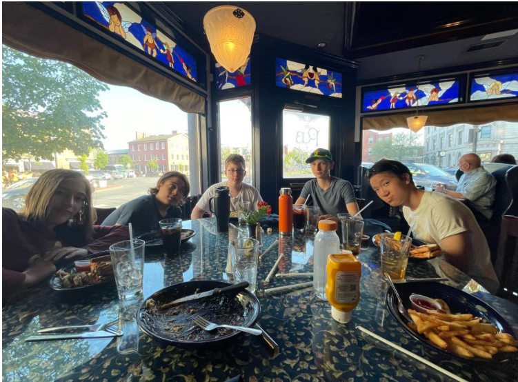
Sharing a meal during the retreat.