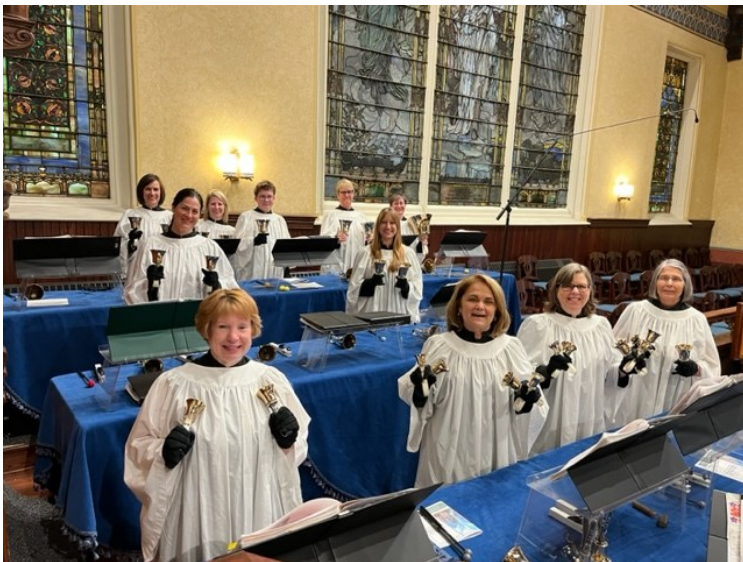
The '2022-2023 class' of the Gloria Dei Ringers.