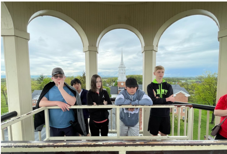
The excitement was palpable as the confirmation class explored the Schmucker Hall cupola at United Lutheran Seminary.