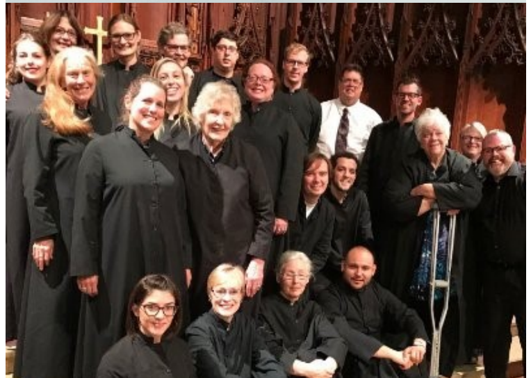
The Pittsburgh Compline Choir